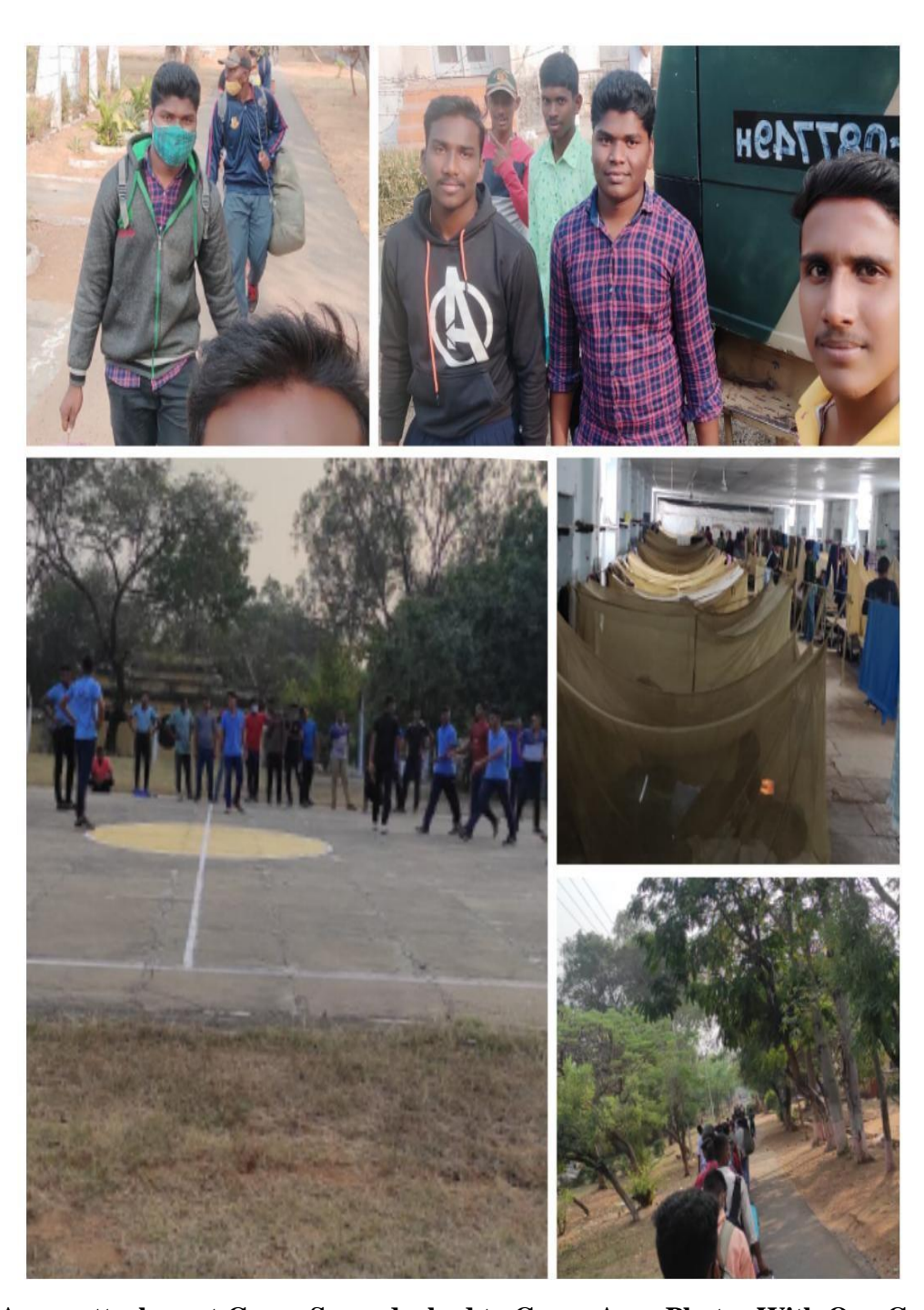
At The Army attachment Camp Secundrabad to Camp Area Photos With Our Cadets..