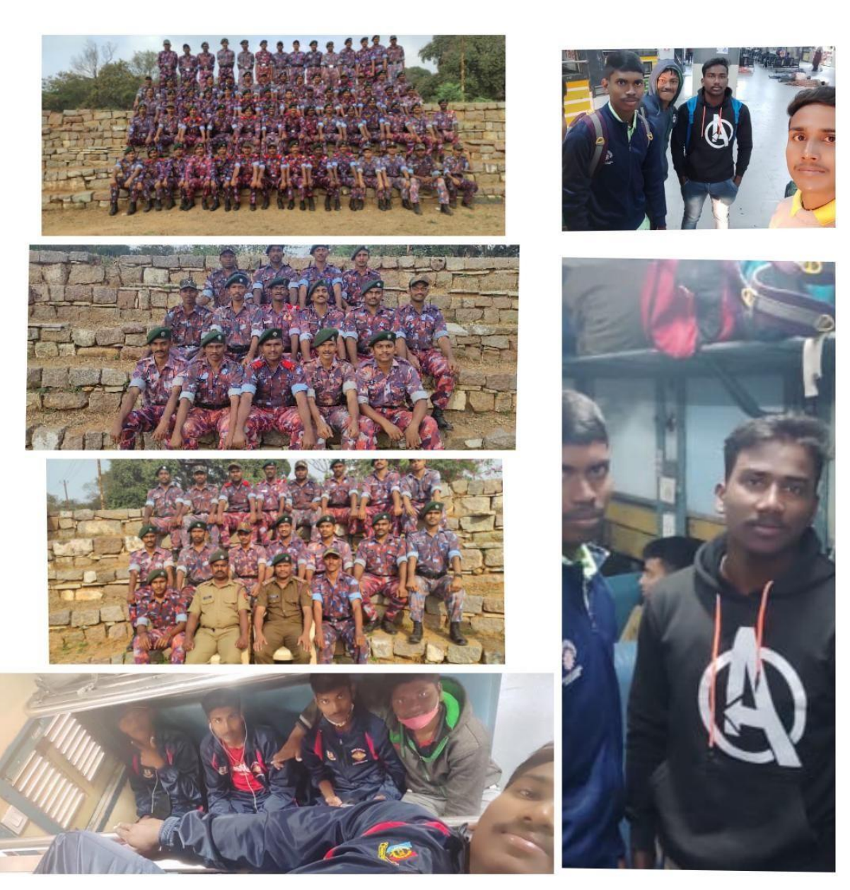
Our Cadets Are Travelling to Vijayawada to Secundrabad railway Station Photos , and Our Cadets Are Jungle Dress, Track suit....