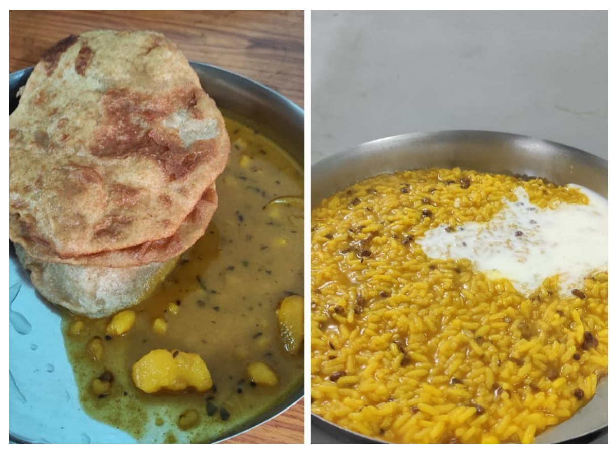
This is in the Army Attachment Camp at Secundrabad Food is Poori with Potato Curry And Rice with Dal and Curd