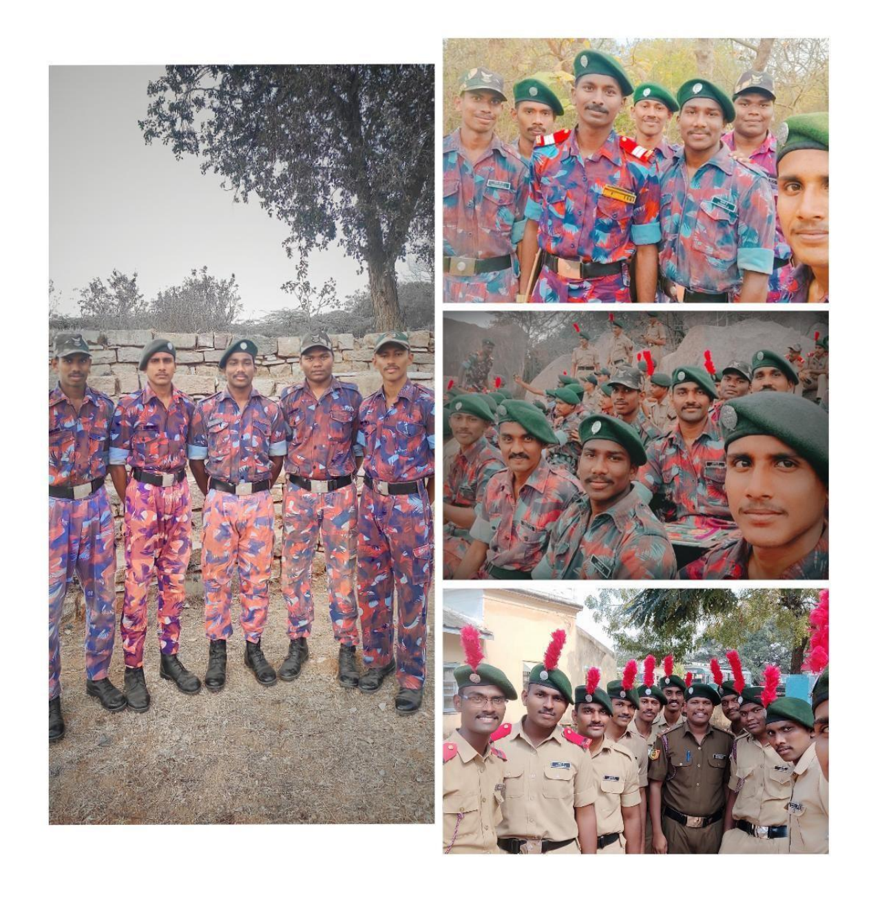
In This Picture Has Our Cadets Taken A Photo With Senior And ANO Sir..