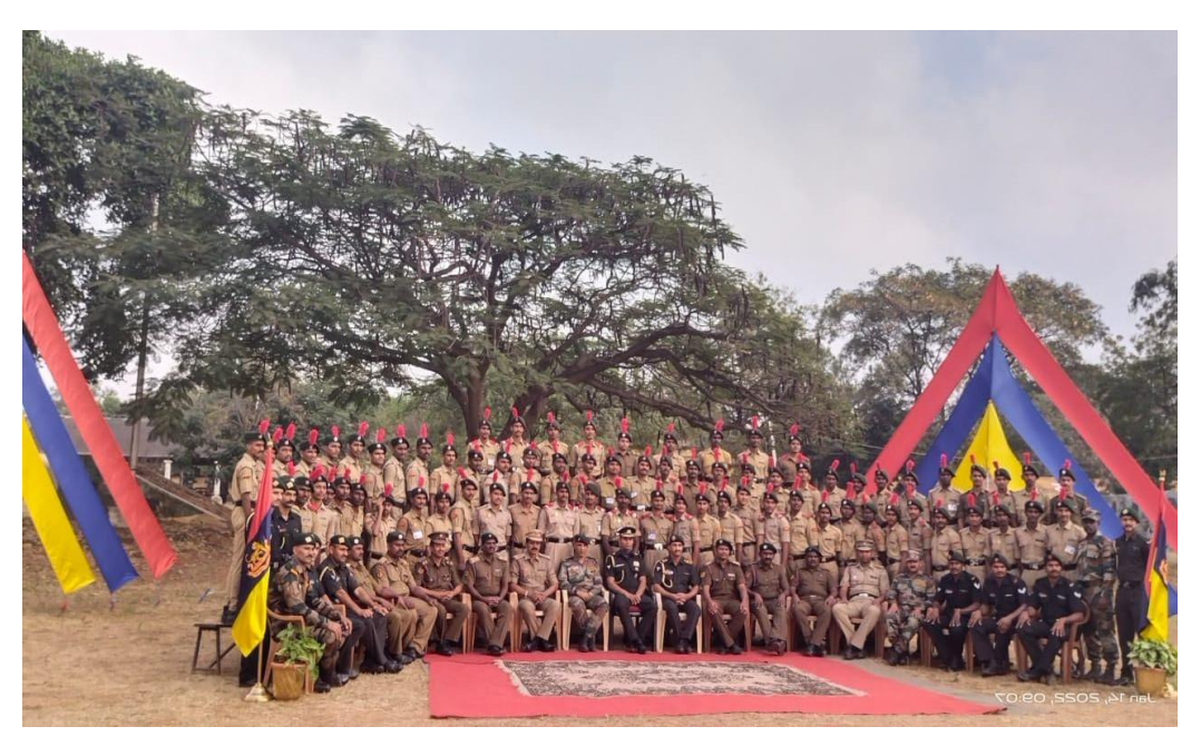
A Group Photo In Army Attachment Camp Conducted By HQ 76 INF BDE,

Army attachment camp was held from 02 jan 2021 To 15 jan 2021. The NCC SD CADETS From our 88 B COY, Government Degree college 05 Cadets are attended to ATT CAMP ... The main of this ATT TRG is to impart basic military TRG to the Cadets.