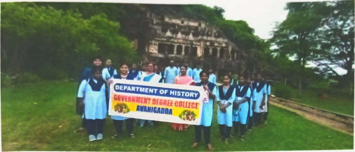
Students and staff at Undavalli caves