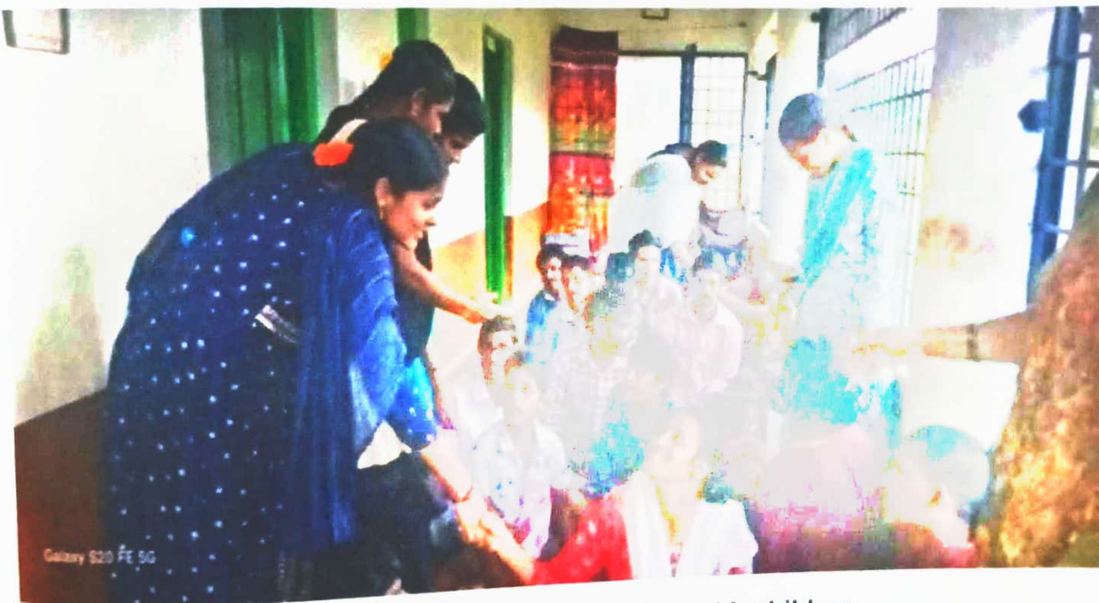
Principal, staff members and students interacting with children