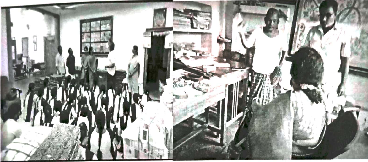
Explanation to students at Prasad kalamkari various stages of kalamkai & Block carvings