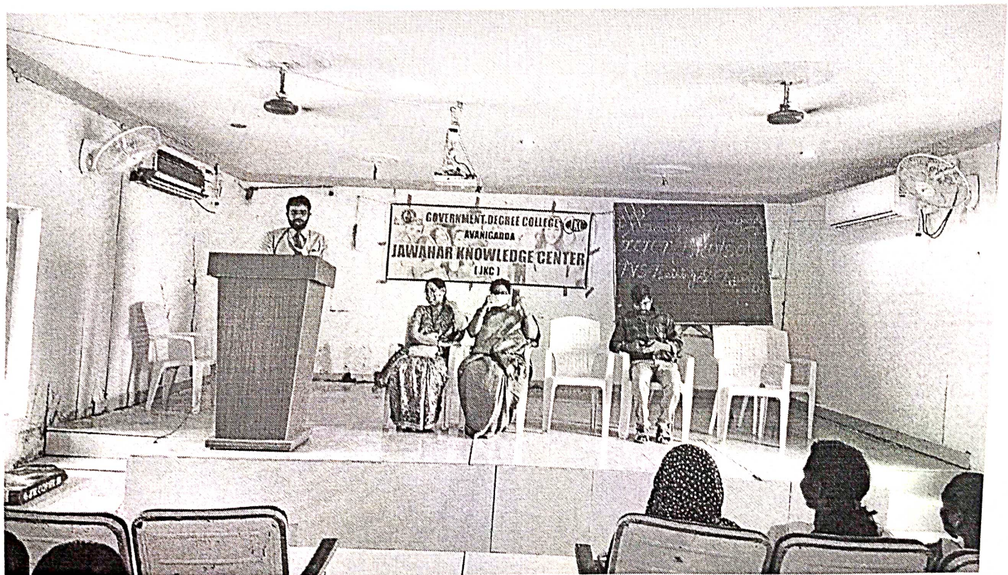
Speech by CEO of TVS Company