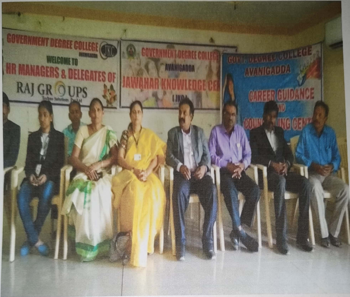
Meeting With Staff And Participants