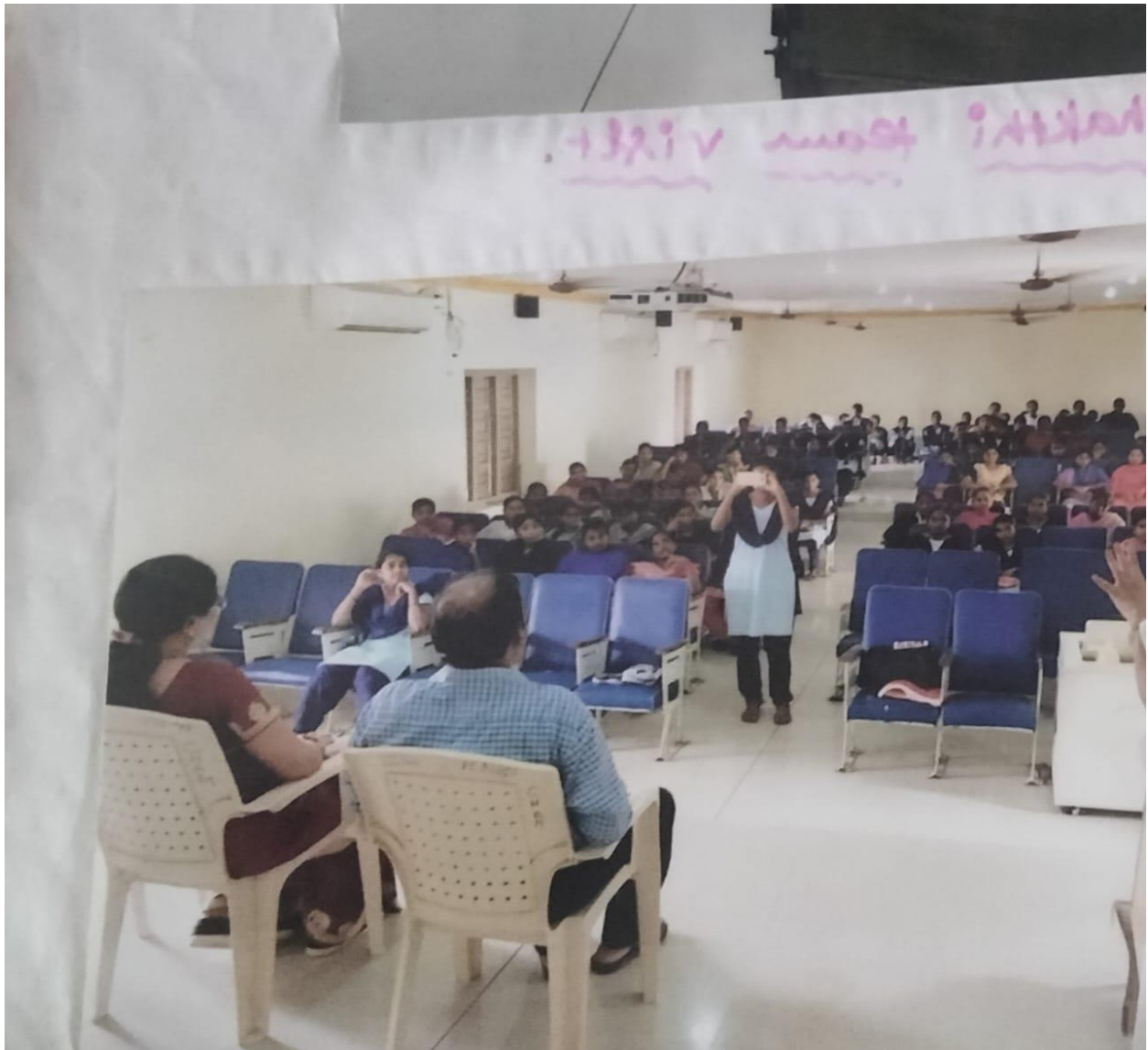
Student participation in legal awareness programme