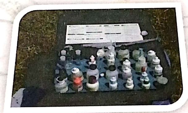
Fig 2:-Water quality testing kit

Water samples were collected for physicochemical analysis from two sampling ponds from 15 Aug 2018 to 15 Feb 2019 interval. Simple random sampling method was used for the primary data collection. Three different points from each pond were identified for random sampling. Samples were analyzed for some parameters namely temperature, pH, salinity, dissolved oxygen (DO), transparency, alkalinity and hardness. Water temperature, pH, salinity and transparency of pond water were measured by thermometer, pH meter, salinity meter and Secchi disc respectively, where titration methods were used for the measurement of alkalinity and hardness and D.O.. After the laboratory analysis, all the findings were integrated and presented in tables and charts and put in the report.