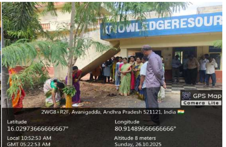
Celebration of Karthik Vanamahostav on 26-10-2025 by the students and the staff members.