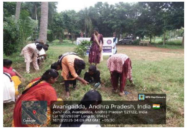
Clean and Green Programm by the students in the Campus on 16-10-2025