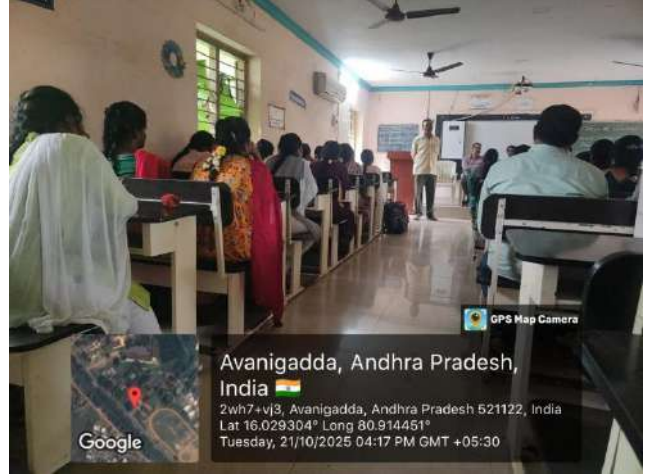
SIP Program Valedictory on 21-10-2025