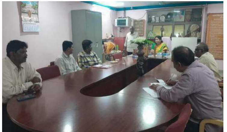
Affiliation inspection by the Krishna University Team on 21-10-2025 they visited college Campus, all the departments and labs.