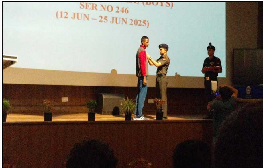
NCC Cadets' Graduation Day Celebrations at Nehru Institute of Mountaineering (Nim) Uttarkashi, Uttarakhand State .