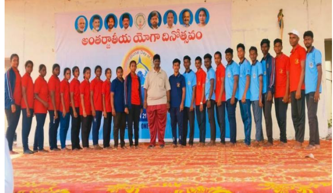
NCC Cadets' were participated in 11 th International Yoga Day 2025