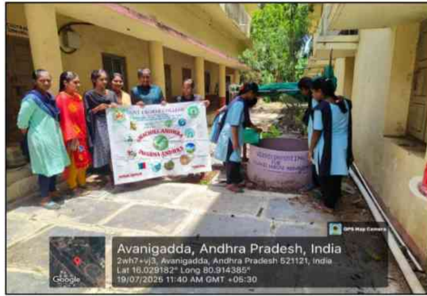
SASA program -Vermicompost pit