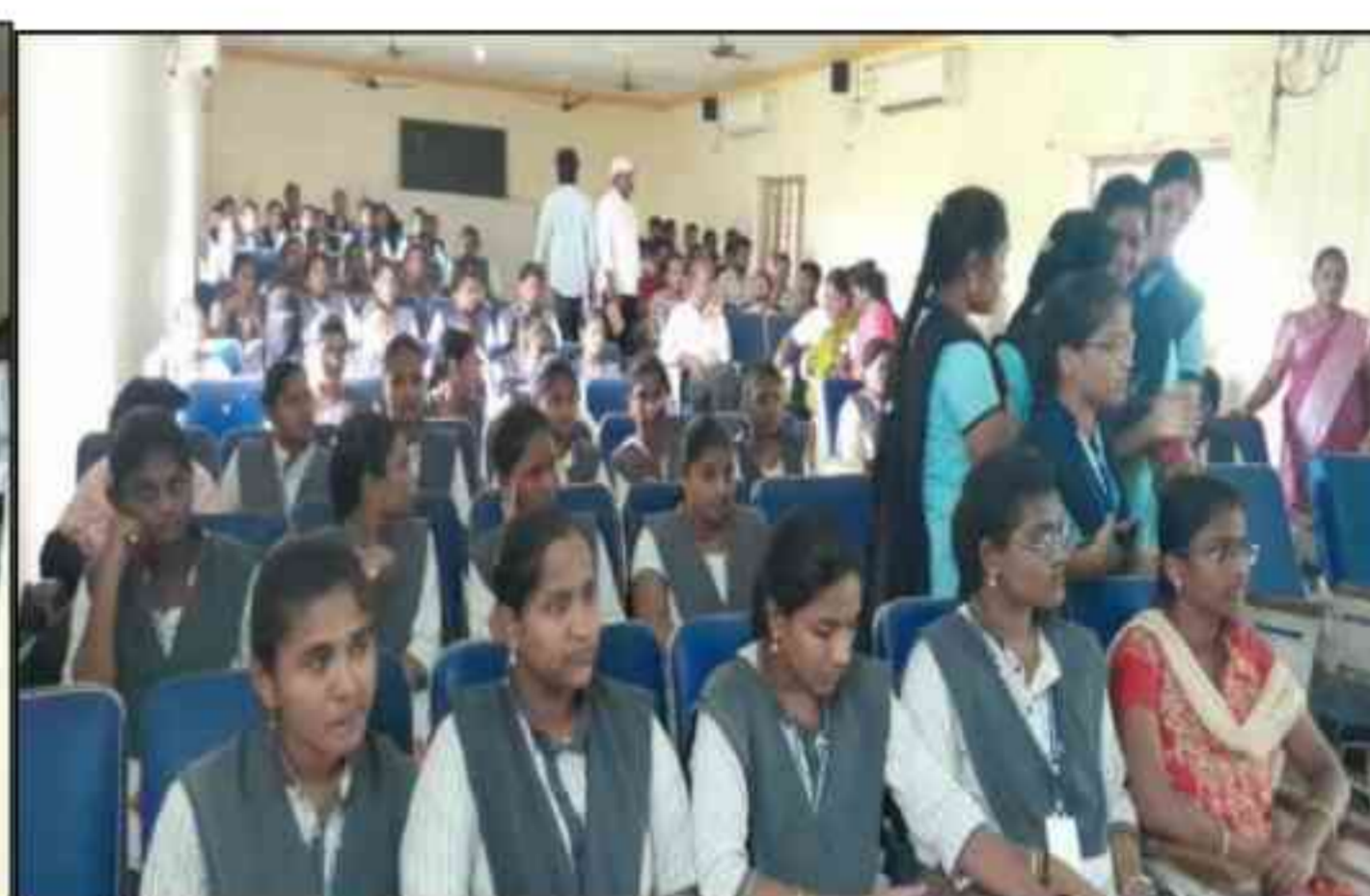
One Day National Seminar Topic: Modern Machine Learning Techniques and AI Tools: A Hands-on Approach was organized by the Department of Computer Science, Govt. Degree College, AvaniGadda on 05-07-2025