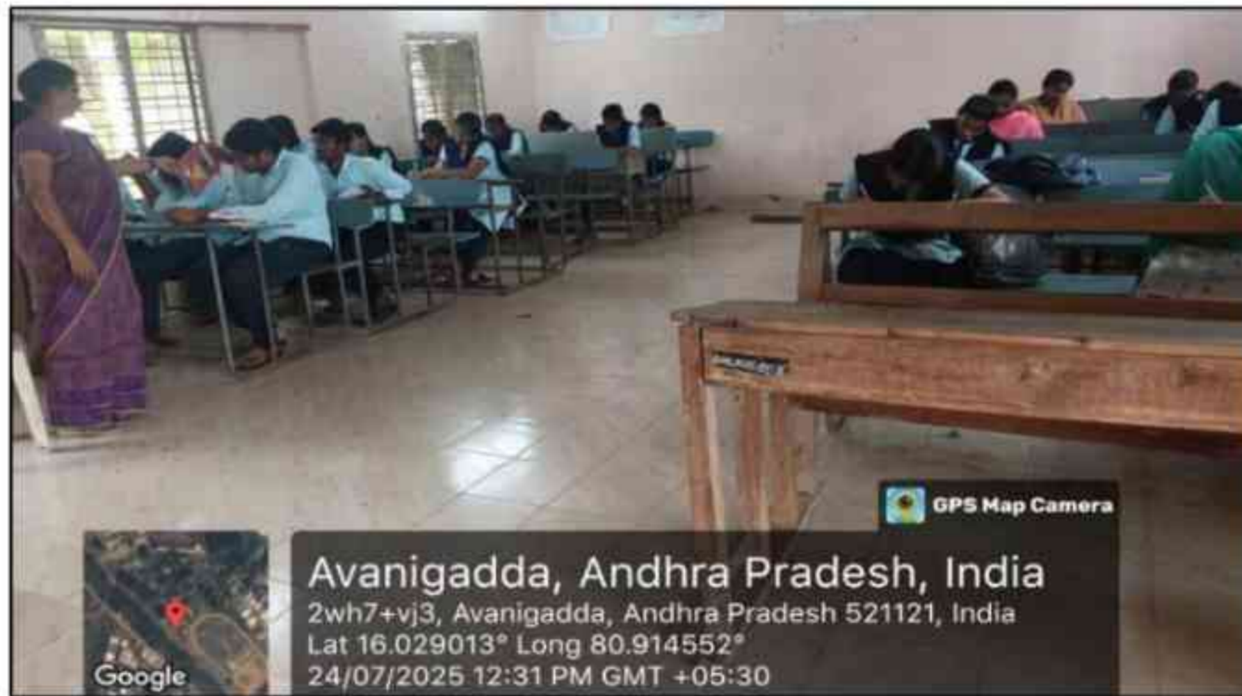
Conducted essay writing by Telugu department on the topic RTI Act, 2005 on 24-07-2025