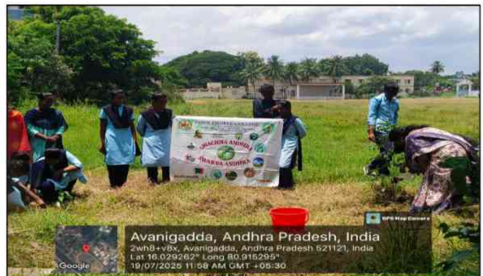
SASA on Plantation program on 19-07-2025