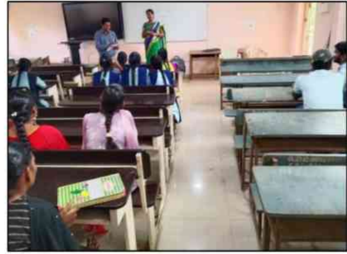
Quiz competition conducted on the topic RTI Act on 26-07-2025