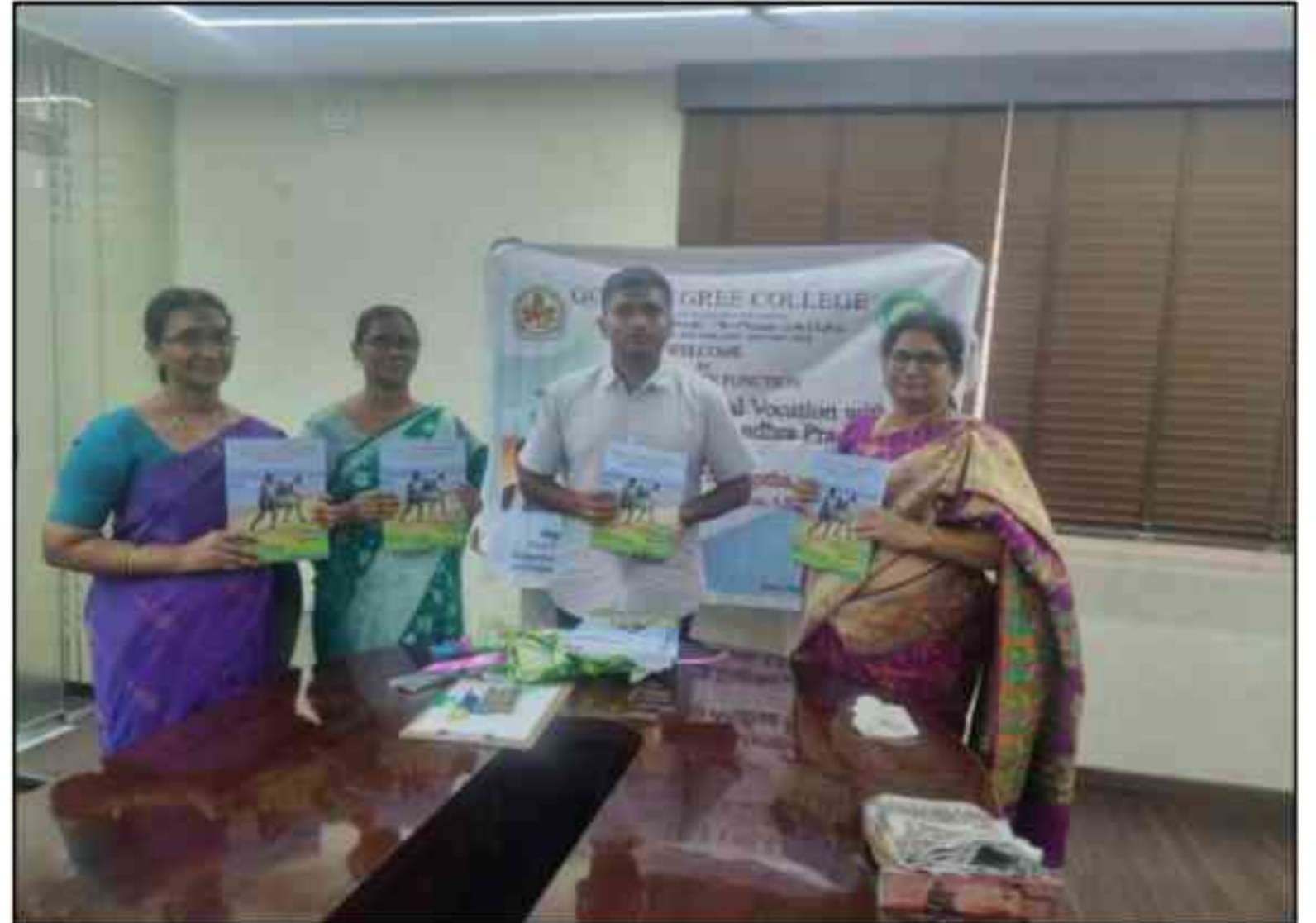
AP CCE Director sir releasing "Fisheries a Potential Vocation " a book compiled by department of Economics, GDC, Avanigadda, on 11-07-2025