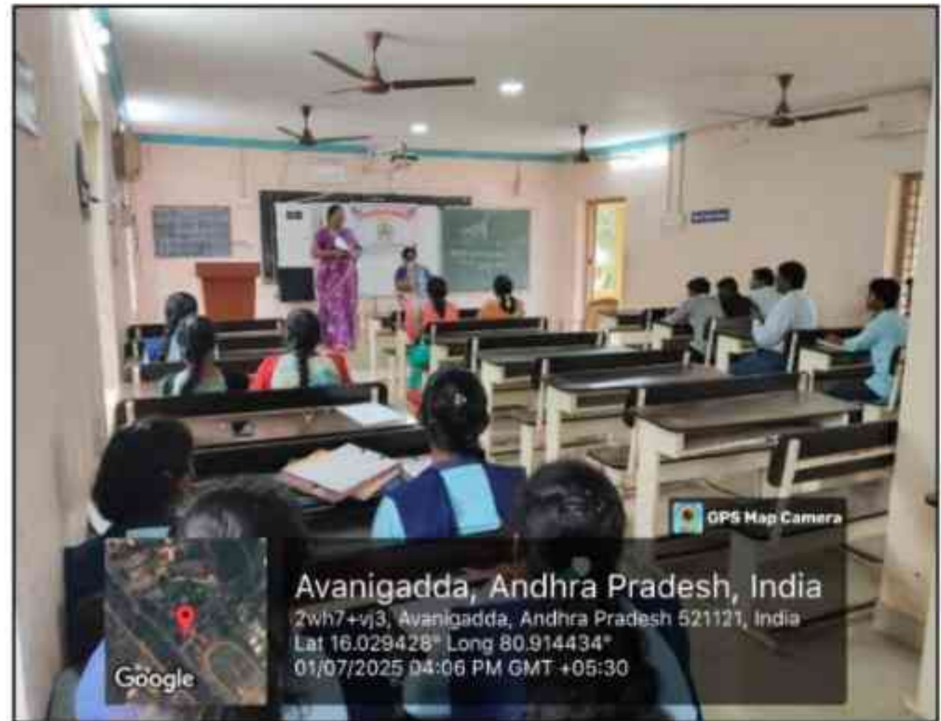
Department of Commerce Celebrates National GST day on 01-07-2025