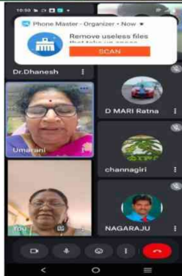
National Webinar on Entrepreneurship as a Career Option"Organized by Department of Commerce , Govt.Degree College AvaniGadda ,on 14-07-2025