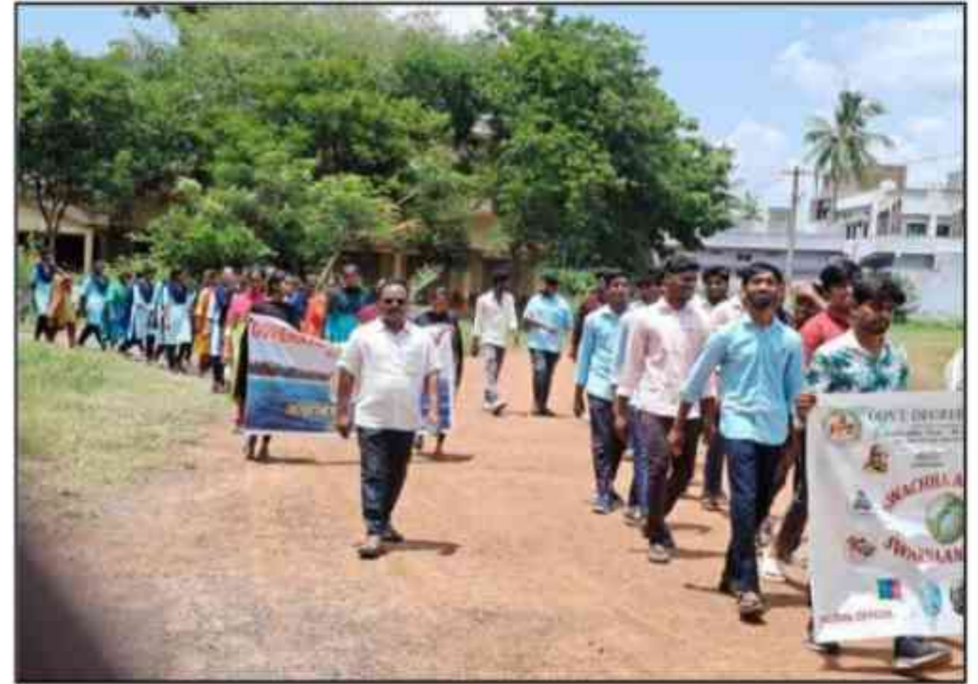
On SASA- Plantation program staff and students were participated in Rally and Pledge on 19-07-2025