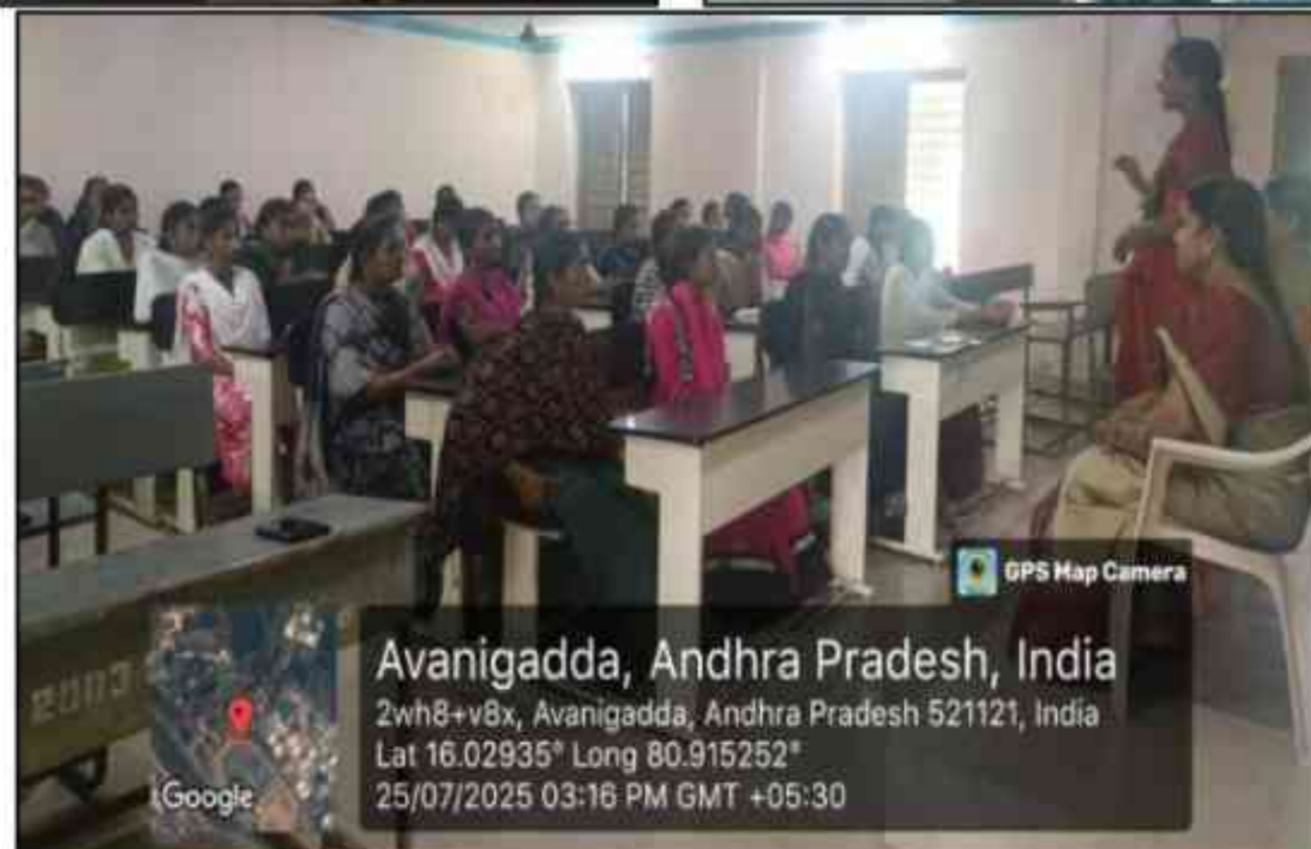
An awareness program on safety precautions for girls and gender rights organized by WEC on 25-07-2025