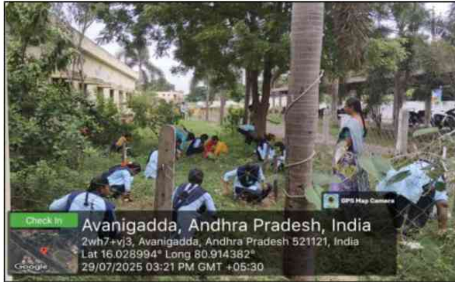
Garden cleaning by BA students on 29-07-2025