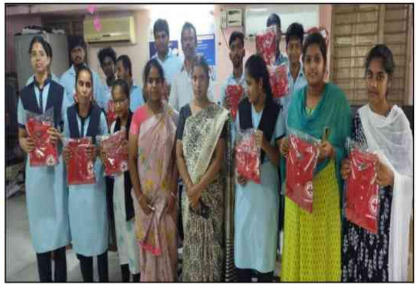
Mentors handed over the Red Cross T-shirts to Mentees on 25-07-2025