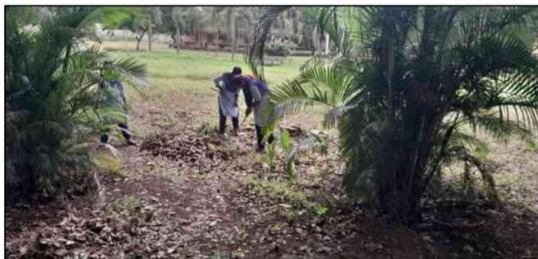
Physics department clean and green on 07-07-2025