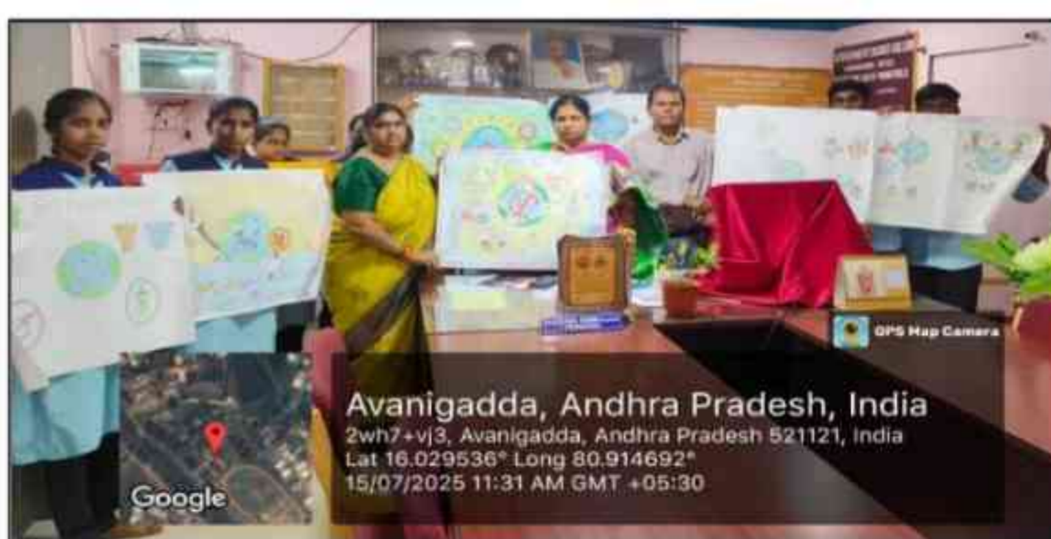
SASA program by Chemistry Dept. On 15-07-2025