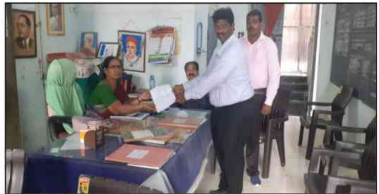
Admission campaigning at Govt. Jr. College, Repalle on 09-07-2025