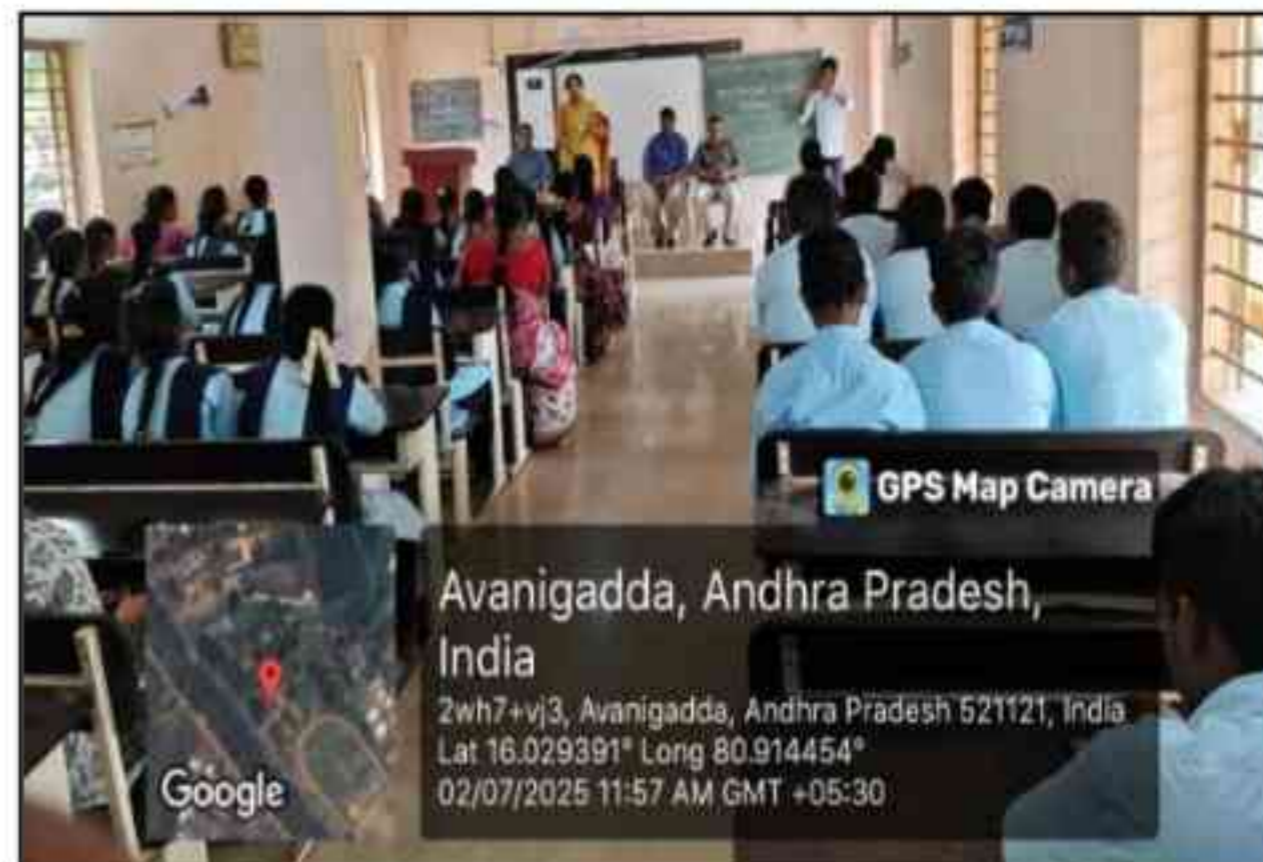
Department of Chemistry conducted a “Youth for social impact” orientation program on 02-07-2025