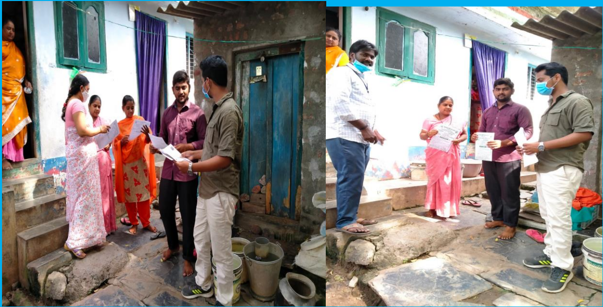
Avanigadda 7 th Ward